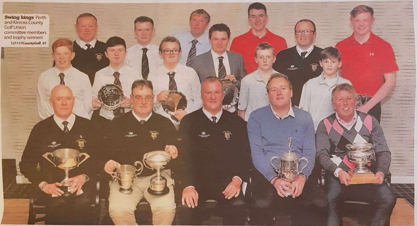
Swing kings Perth and Kinross County Golf Union committee members and trophy winners 121117CountyGolf_01